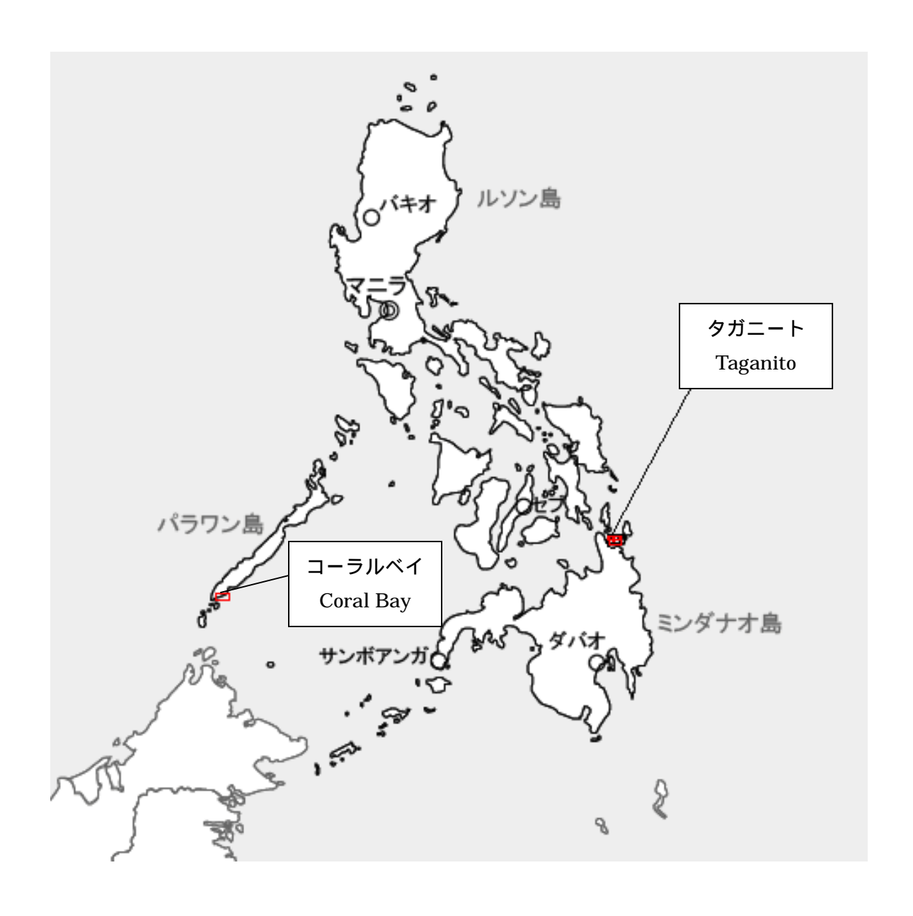
図1. 位置図 Fig.1 Location