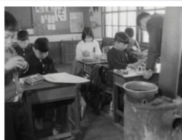
Sumitomo Tonaru Private Elementary School