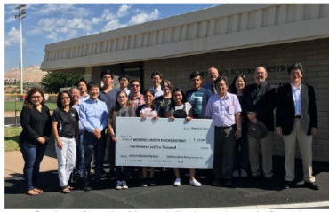
Students from the Morenci district and people from the SMM Scholarship Fund