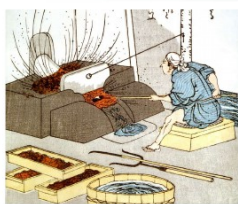
Nanban-buki (Kodo Zuroku)