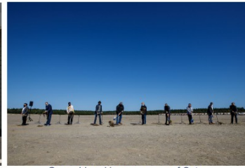
Ground-breaking ceremony of Cote Chiefs of First Nation joined