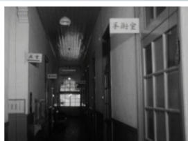
Sumitomo Besshi Hospital, Tonaru Branch

1967, Besshi Copper Mine, Tonaru District