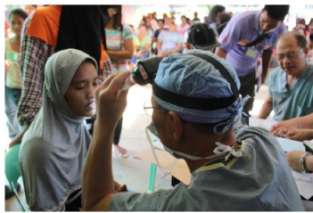
Free medical care for local residents (The Philippines)