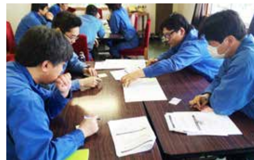
Small-group activities training (Taihei Metal Industry Co., Ltd.)