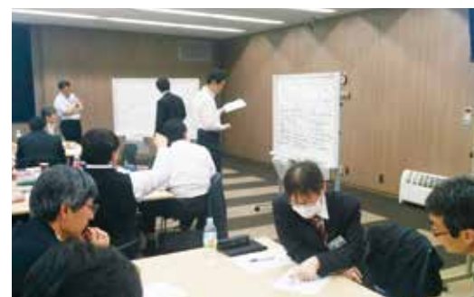
Quality control officer training (Head Office)